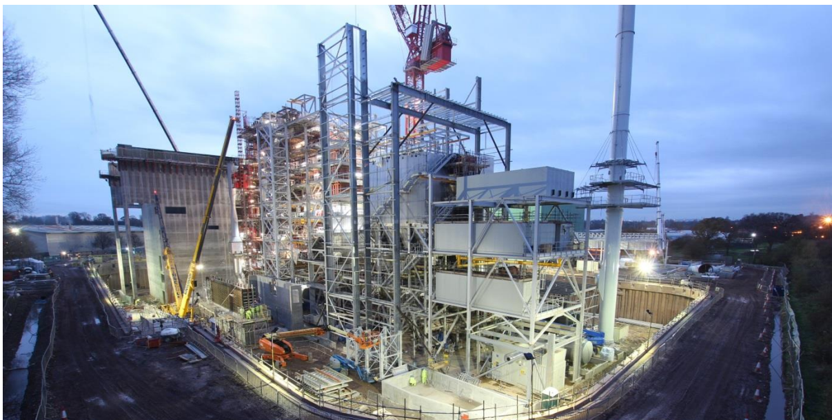
Envirecover Energy from Waste facility under construction.

Since publication of the Strategy, the Partnership has made significant progress in plans to divert residual waste from landfill. Worcestershire County Council and Herefordshire Council have a long term contract with Mercia Waste Management (MWM) for the delivery of their responsibilities as Waste Disposal Authorities. As part of the contract, MWM obtained planning permission, has managed the construction of and is now operating, an Energy from Waste (EfW) facility at Hartlebury. This facility will divert an additional 200,000 tonnes of municipal waste from landfill.